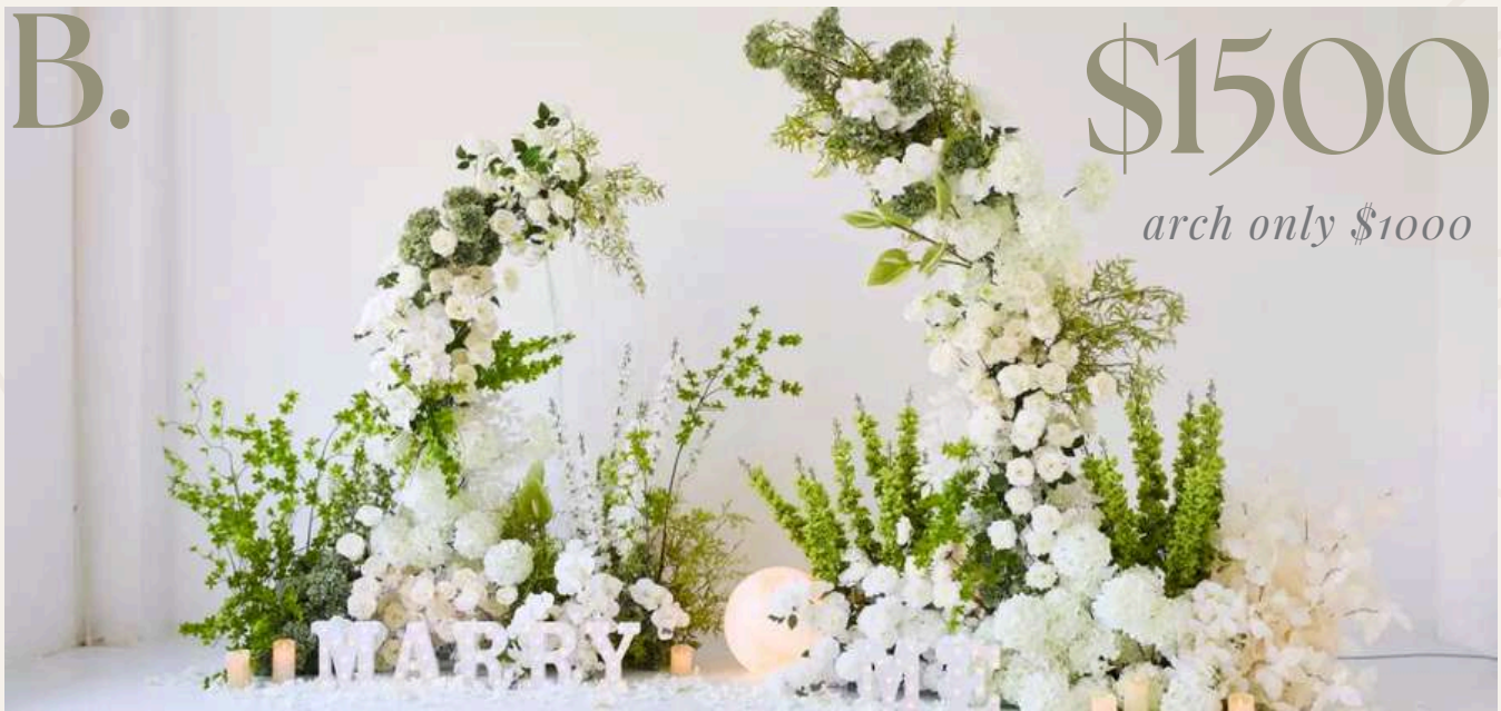
arch only $1000